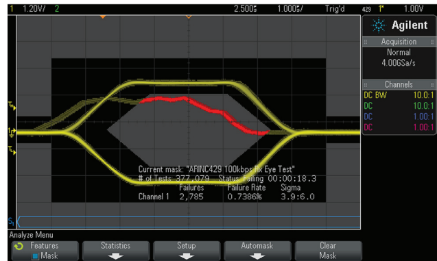
Figure 2: Pass/fail masks based on industry specifications can be created on a PC and then downloaded to the scope.

Another method is to import a multi-region mask that has been previously created on a PC based on published standards. Figure 3 shows an example of an eye-diagram test based on an imported mask of an ARINC 429 serial bus signal which is common in the aerospace/defense industry. In this example we see that a significant number of pulses are failing the test.