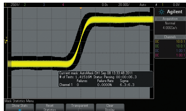
Figure 1: Mask testing can test multiple wave shape parameters at once including maximum allowable noise.

multiple characteristics of captured waveforms can be tested using a single mask. Rather than testing against a specific parameter, such as a peak-to-peak voltage, mask testing will test the overall shape of a waveform that may include Vpp, rise time, pulse width characteristics, as well as maximum allowable noise.